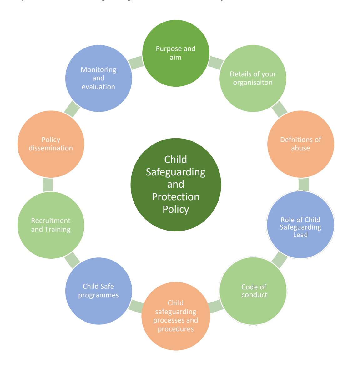
Figure 2. Components of a Child Safeguarding and Child Protection Policy

Your Child Safeguarding and Protection Policy should include details on: