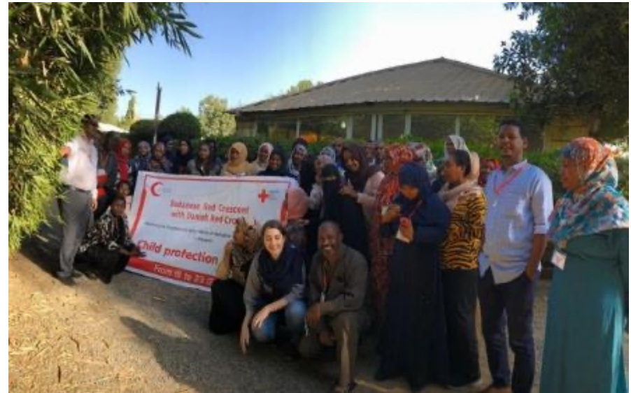
Child Protection Training, Kassala, Eastern Sudan.