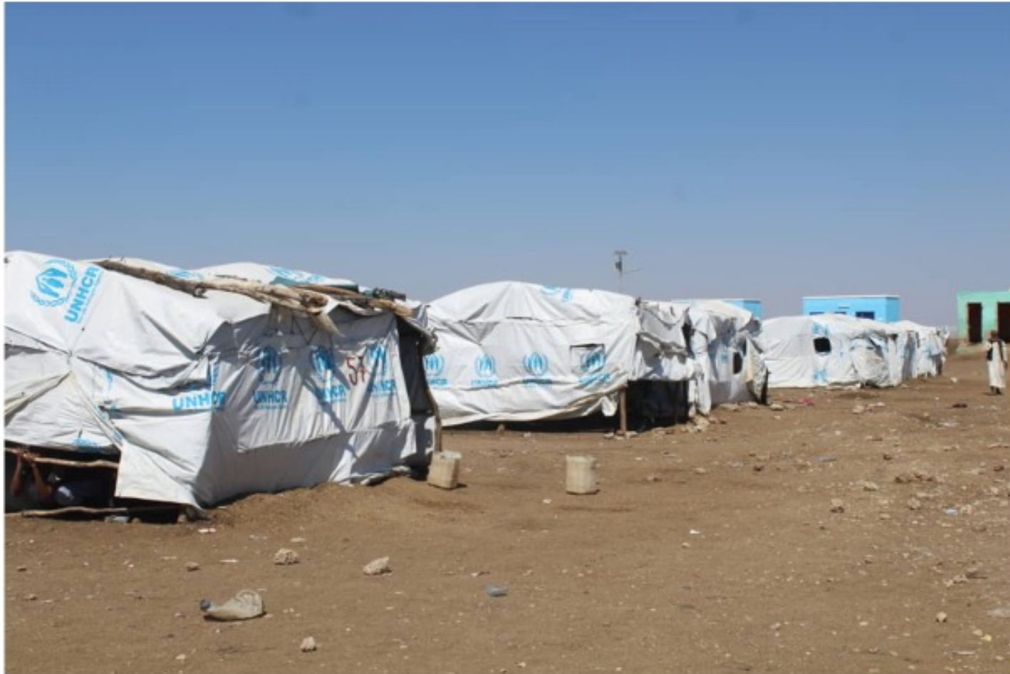
Reception Centre, Shagarab Refugee Camp.