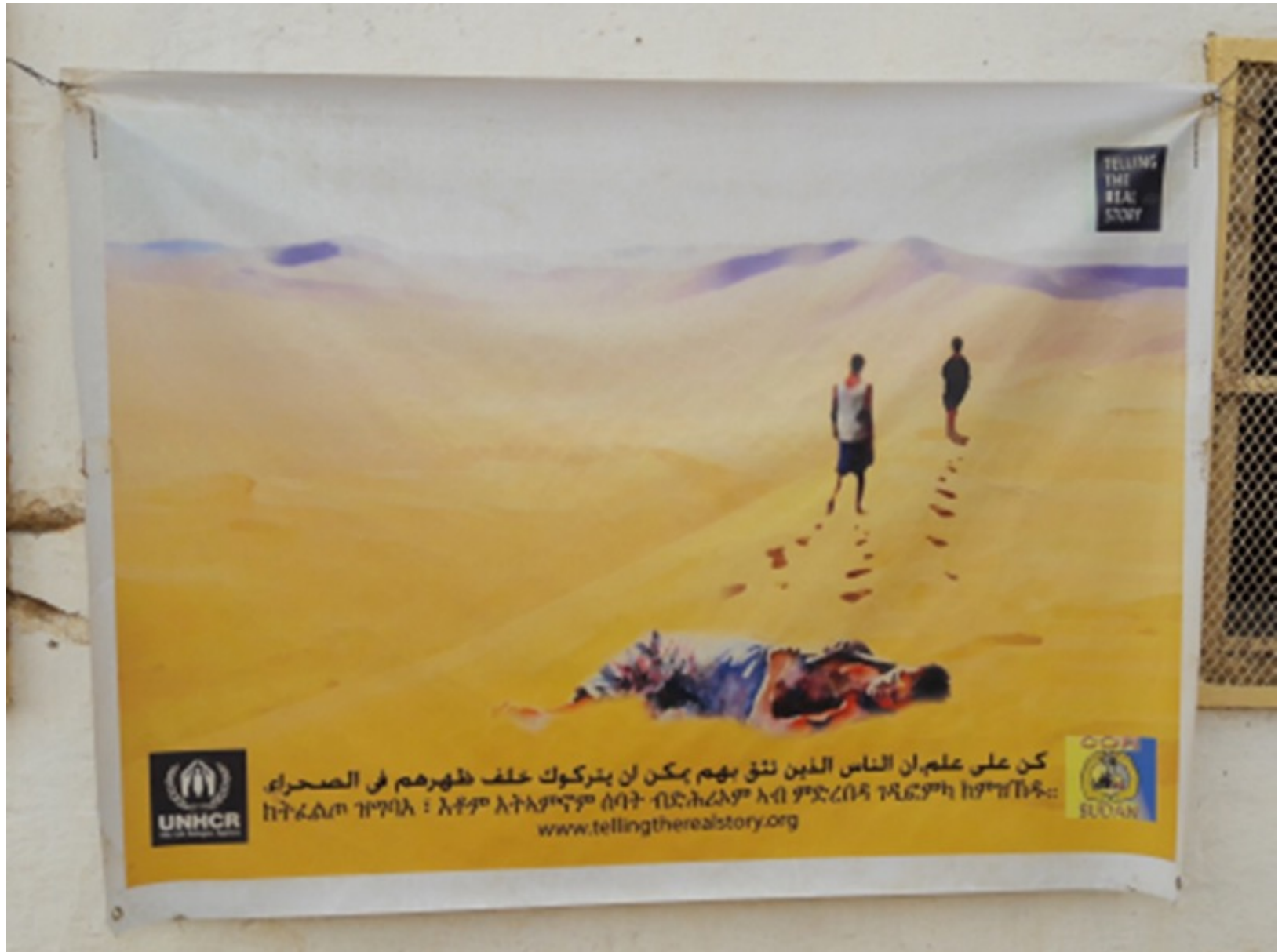
Poster in Wad Sherefey Refugee Camp, Eastern Sudan.