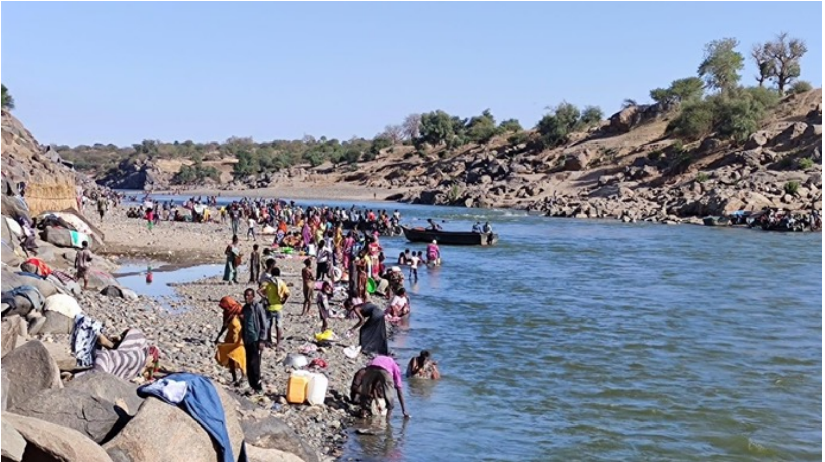
Refugees at Hamdayet border crossing, Eastern Sudan