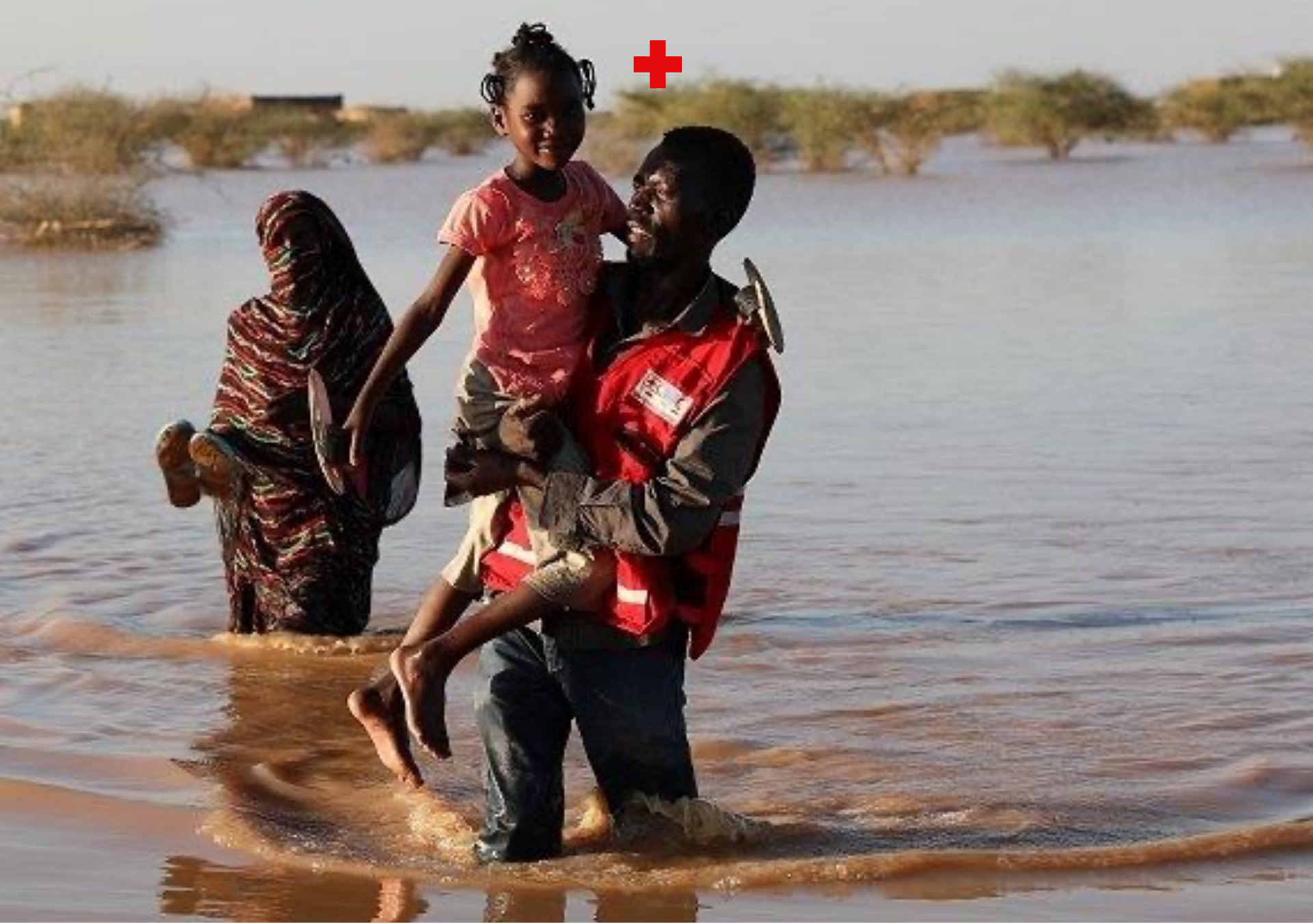
Sudanese Red Crescent volunteers supporting people displaced by flooding.