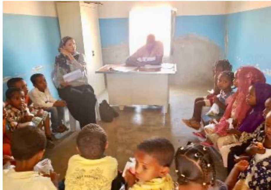
Group discussions with children.