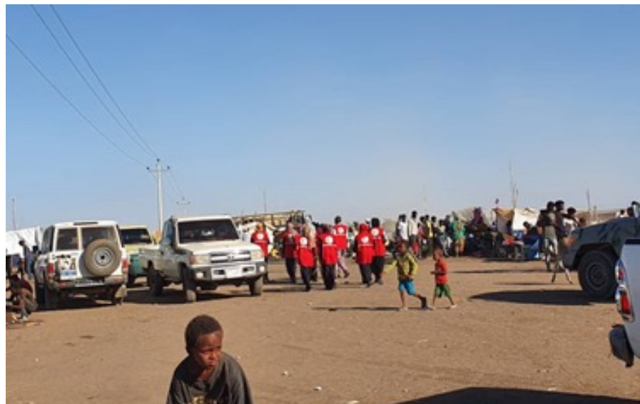
Sudanese Red Crescent volunteers supporting newly arriving refugees in Eastern Sudan.