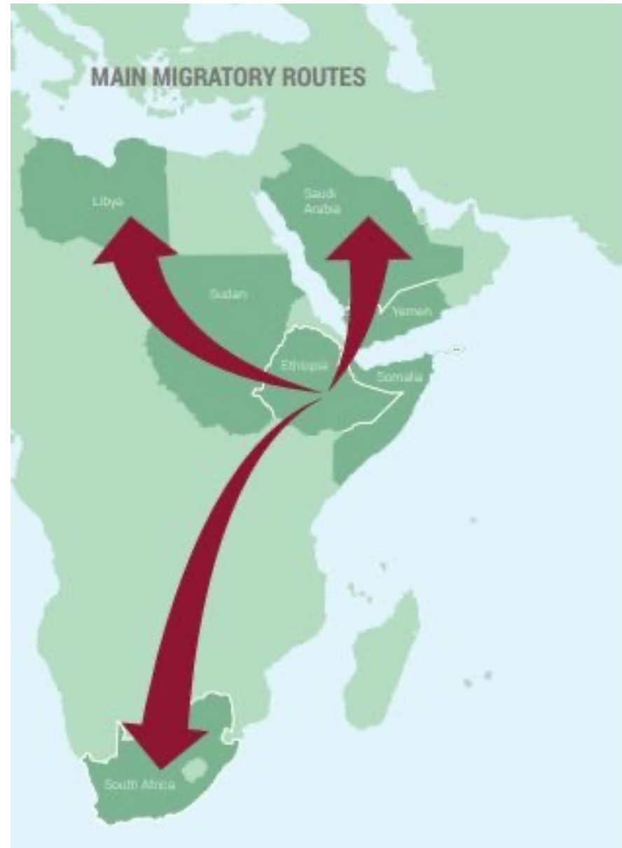
Graphic: Danish Red Cross