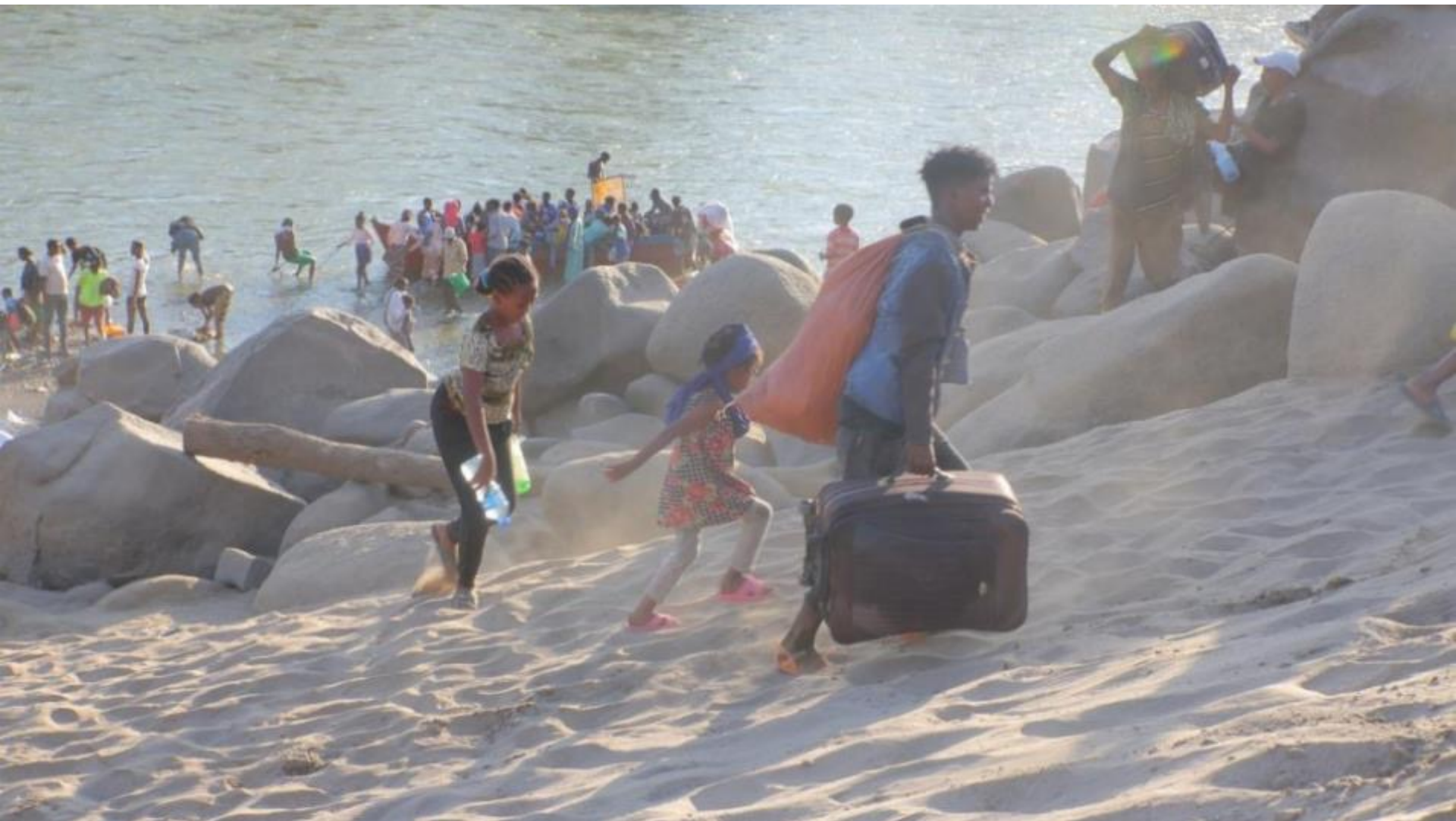
Children crossing the river near Hamdayet Border Transit Centre, Eastern Sudan