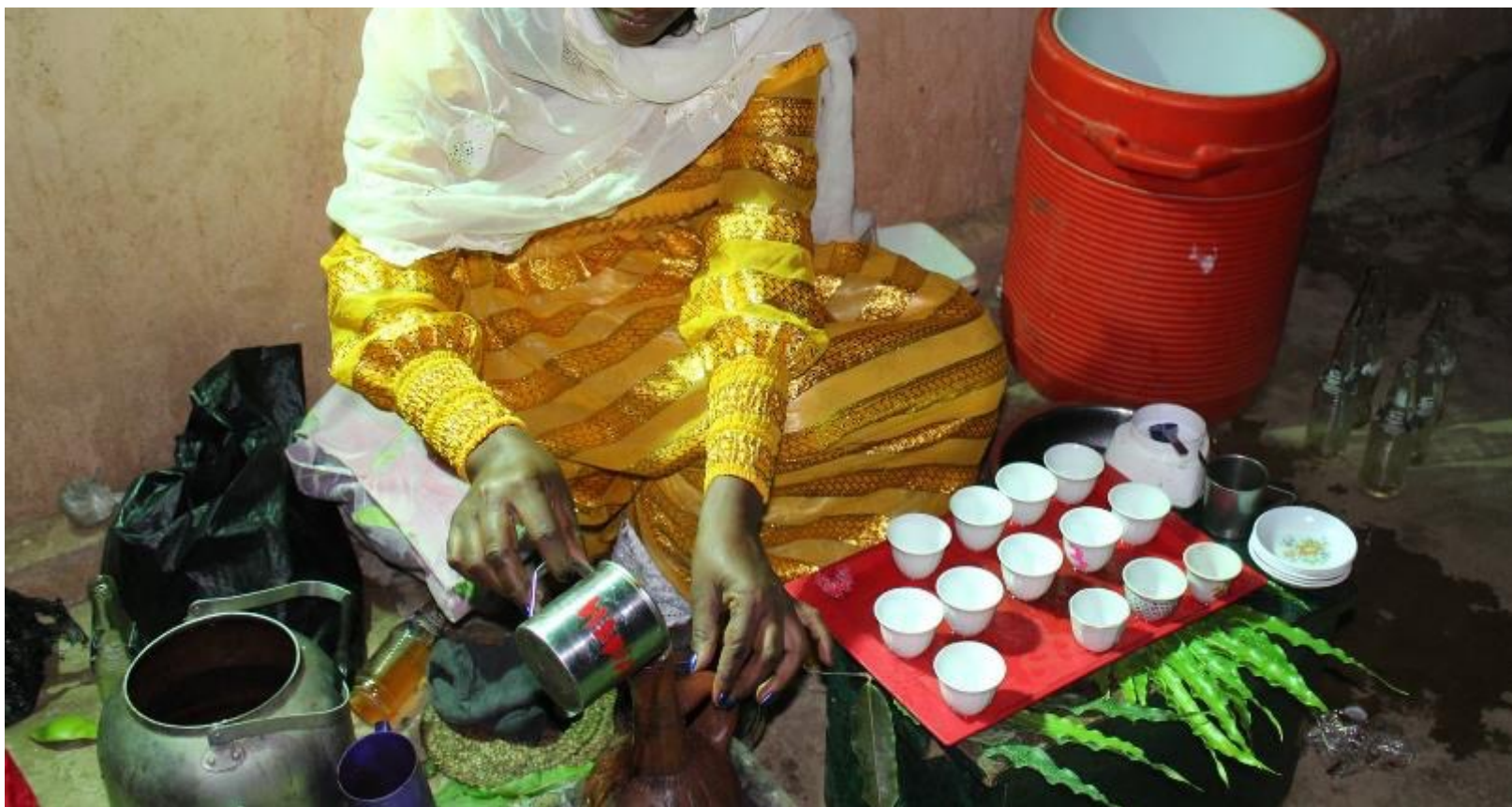
Cultural & recreational activities for young people in safe houses in Eastern Sudan.